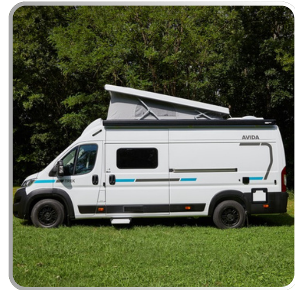
Optional Roof top bed