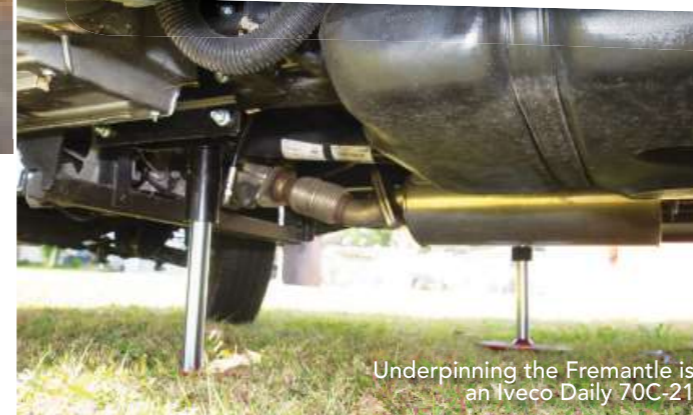
Underpinning the Fremantle is an Iveco Daily 70C-21