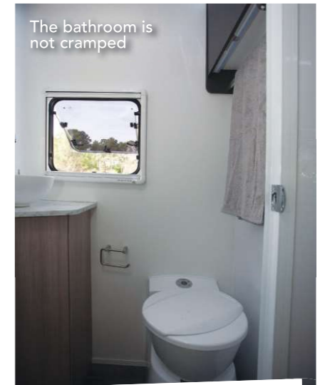
The bathroom is not cramped