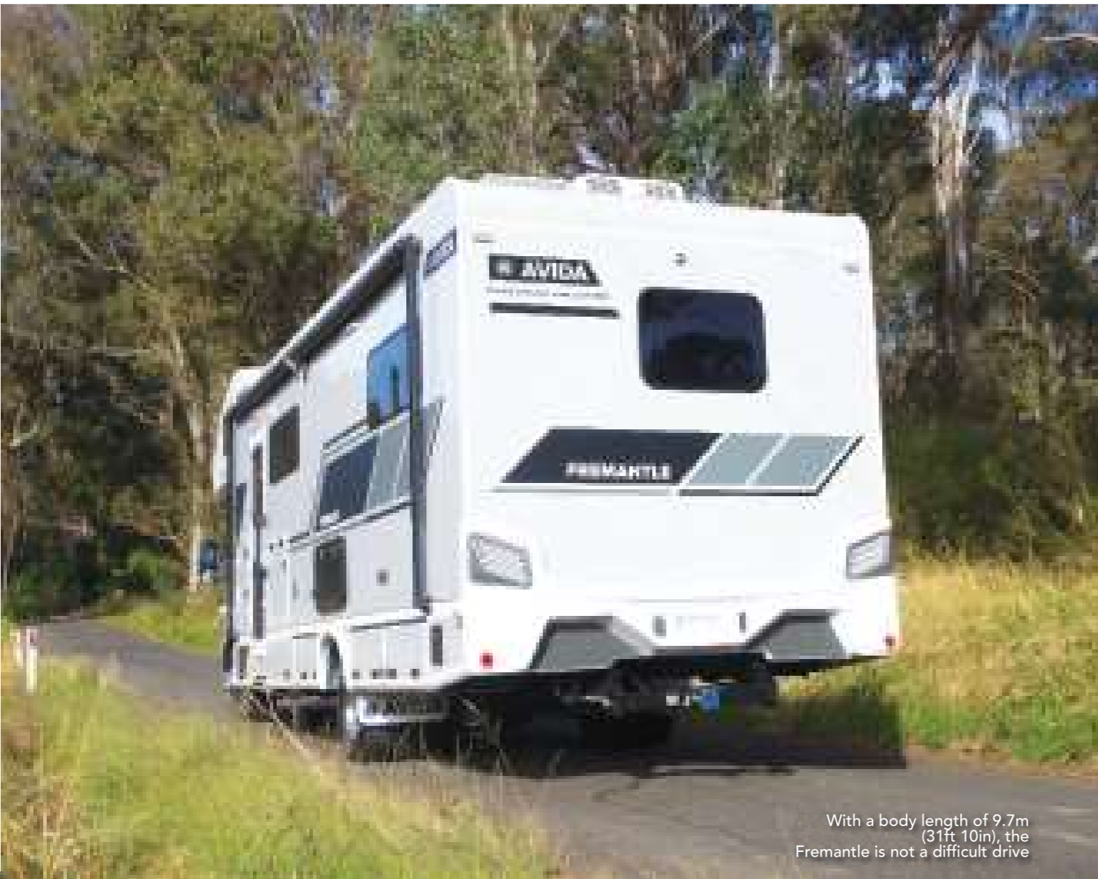
With a body length of 9.7m (31ft 10in), the Fremantle is not a difficult drive

Being Australia's largest motorhome manufacturer does give Avida the advantage of having a good range of motorhomes in all shapes and sizes. At the heavy end of the range though, that is anything over 8.0m (26ft), there's a choice of just two motorhomes. The Isuzu NQR based Longreach which has been in the Avida stable for some years or the more recent Fremantle, a new model which has recently been introduced to the market.