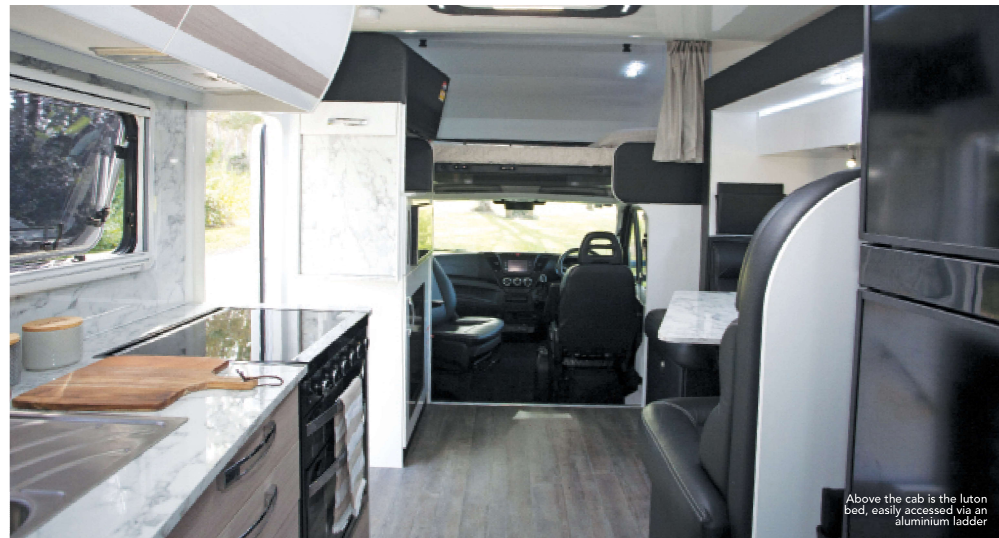
Above the cab is the luton bed, easily accessed via an aluminium ladder