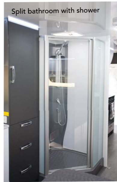
Split bathroom with shower

plenty of walk round room and the nearside cabinetry which comes with wardrobes, drawers and cupboards, both upper and lower has much to offer in terms of storage. Technologically speaking, the bedroom cabinet is well equipped. Not only does it have a flat screen TV but there's also a pop-up charging station built into the shelving which has 240V, USB and phone charging capability plus a Bluetooth speaker. To be found in one of the lower cupboards is a very useful item, a battery-powered Dyson vacuum cleaner. Around the bedhead itself, there are yet more cupboards plus some very handy shelf space on both sides.