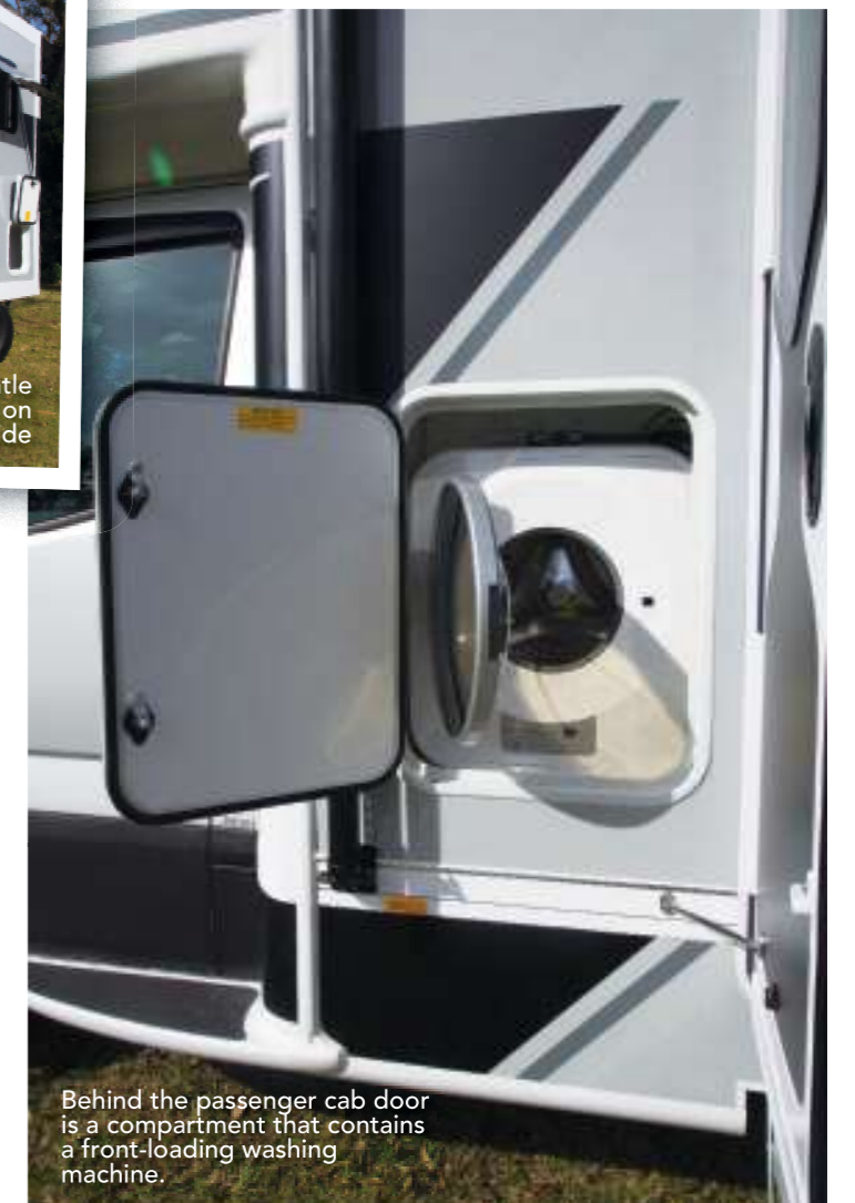
Behind the passenger cab door is a compartment that contains a front-loading washing machine.

“Both the Fremantle slide-outs are on the offside, the forward one has a U-shaped lounge and the rear, the bedhead of an east-west bed