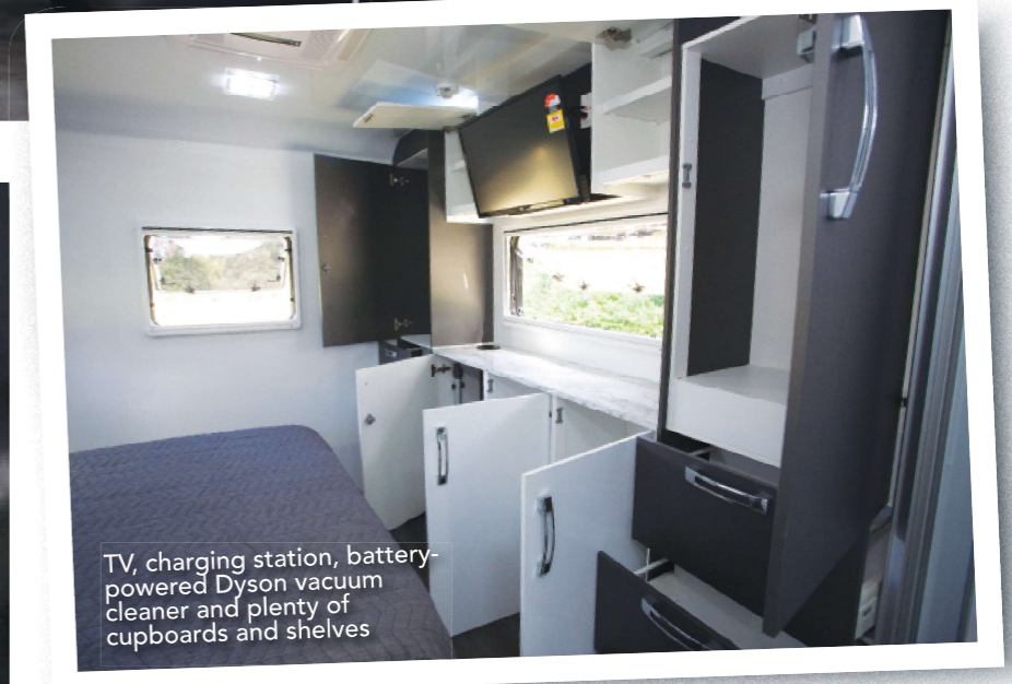
TV, charging station, battery-powered Dyson vacuum cleaner and plenty of cupboards and shelves