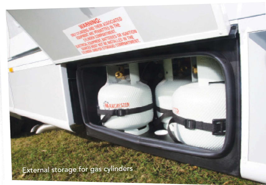
External storage for gas cylinders

a 3.0 litre turbo diesel engine delivering a maximum power of 155kW and a healthily good torque of 470Nm through Iveco's smooth and silky eight-speed torque converter automatic gearbox. The previously optional twin-turbo engine is now an electronically controlled variable geometry turbo (eVGT). With a body length of 9.7m (31ft 10in), the Fremantle isn't a particularly small motorhome but it's not a difficult drive at all, once the length is kept