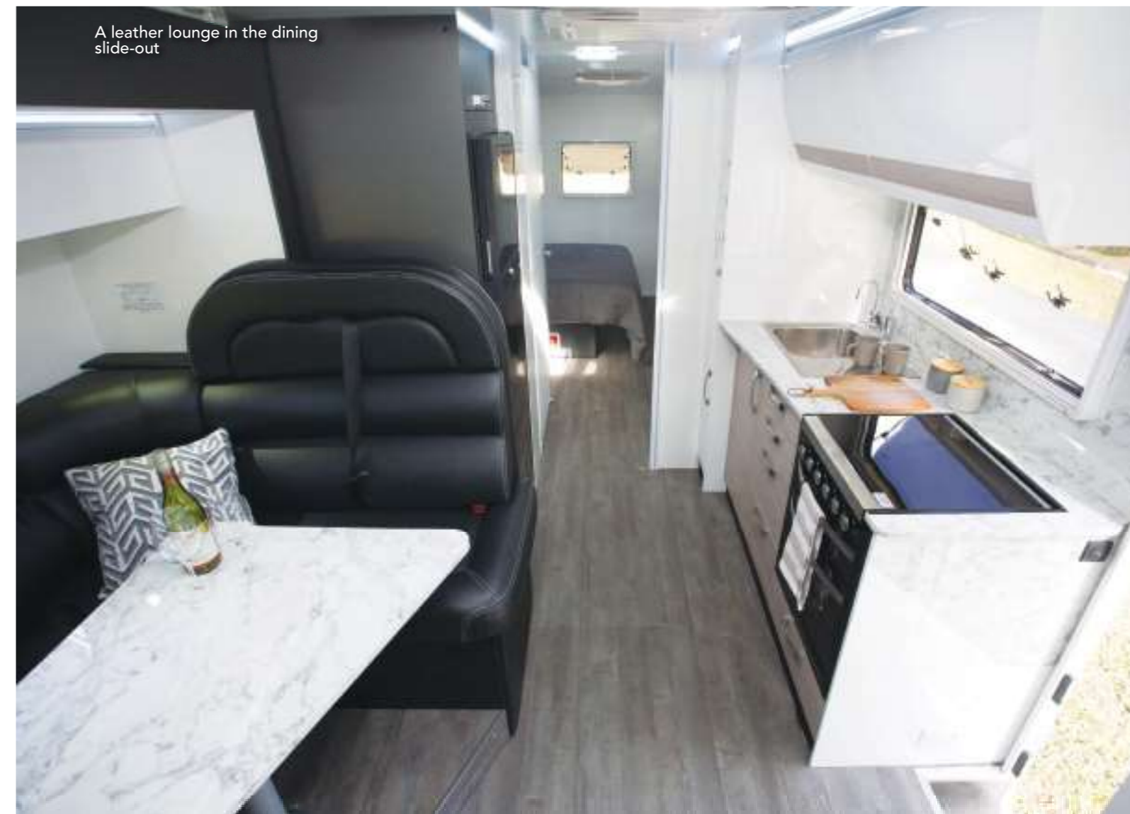
A leather lounge in the dining slide-out

the forward one containing a U-shaped lounge and the rear, the bedhead of an east-west bed. Between the bedroom area in the rear and the lounge area up front, is a split bathroom. That leaves the front nearside wall area for an all-essential kitchen. Being a European-sourced truck, there's easy access to the front cab area and both cab seats swivel around. Above the cab is the luton bed, easily accessed via an aluminium ladder, otherwise, it's a good storage area. Just a little note here, when the front slide-out is closed, it's still possible to get to the bathroom area without too much difficulty.