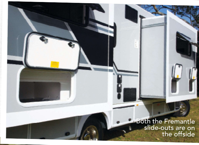
Both the Fremantle slide-outs are on the offside