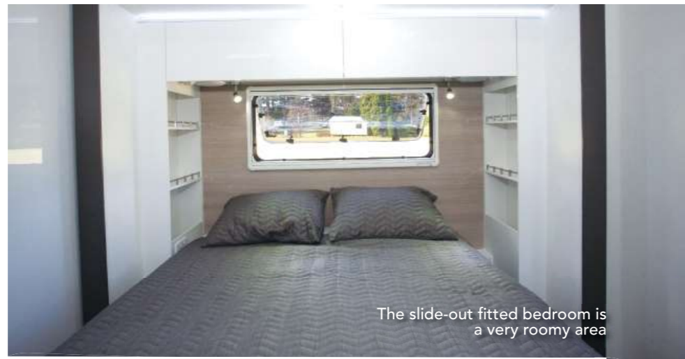
The slide-out fitted bedroom is a very roomy area