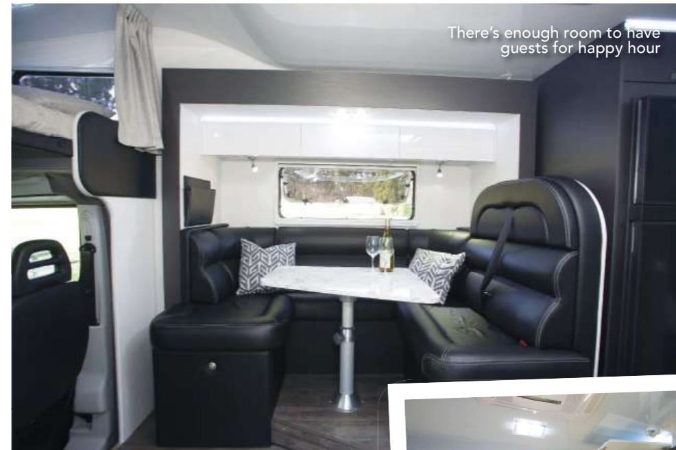
There's enough room to have guests for happy hour