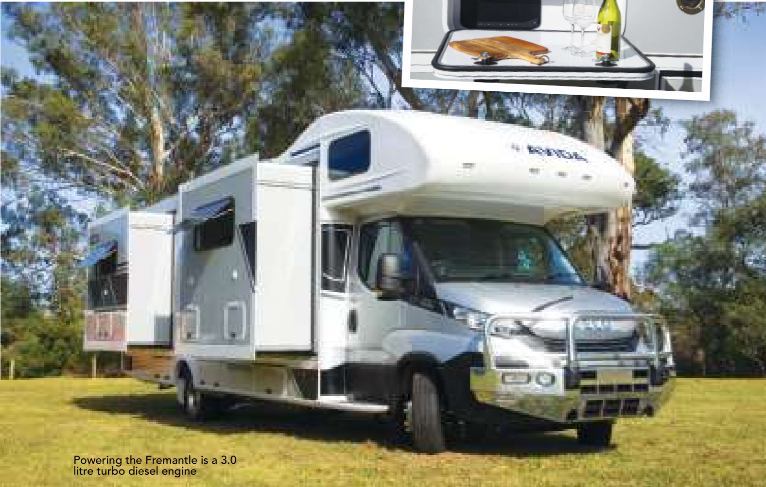
Powering the Fremantle is a 3.0 litre turbo diesel engine

motorhome the Dometic 224 litre absorption fridge sits very neatly between the lounge/dining area and the bathroom cubicle. It's accessible from all sides. Instead of fitting the microwave oven above the fridge, Avida has opted for a much more user-friendly height in the cabinet behind the passenger seat. Above the microwave oven is the mounting point for the second TV and below is a very handy wine bottle cabinet.