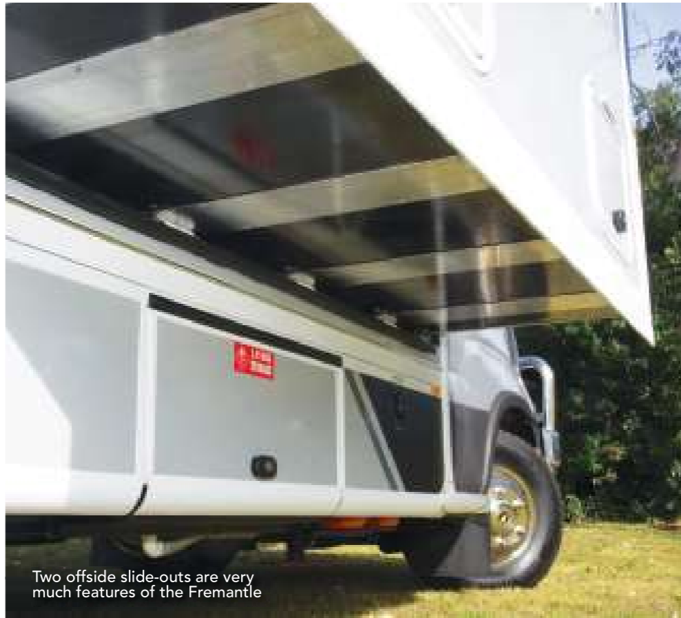
Two offside slide-outs are very much features of the Fremantle

Even though the Fremantle is a C-class motorhome, the luton peak doesn't look like an afterthought and fits fairly seamlessly into the rest of the bodywork. All Avida motorhomes are built the same way. A fully welded metal frame supports the entire body structure and that is a mixture of fibreglass composite for the walls, floor and roof and moulded fibreglass for the luton peak and rear wall fittings. To minimise the risk of water leaks, one-piece panels are used throughout. Aluminium extrusion is used to join the floor to the walls, high-density polystyrene is used for insulation and polyurethane is used for framing. Part of the body structure includes two offside slide-outs which are very much features of the Fremantle. The Dometic habitation door sits almost directly behind the passenger side of the cab and the windows are all NCE double-glazed acrylics.