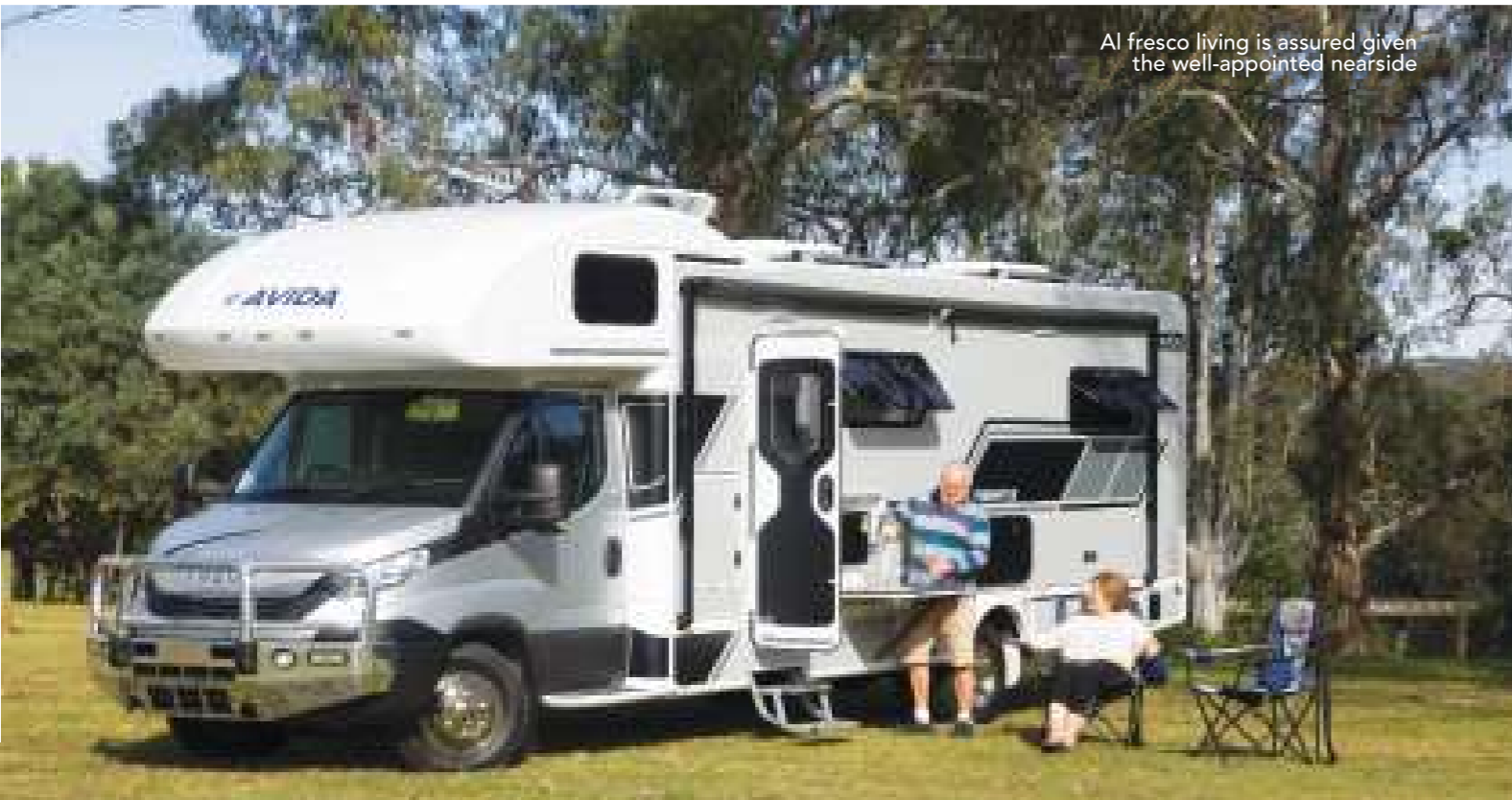
Al fresco living is assured given the well-appointed nearside